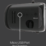
Micro USB Port for Charging

Via AC Adapter/Wall Charger: Using the provided Micro USB cable, connect your VR Headset (Micro USB port) to the AC Adapter (USB port) - not included.